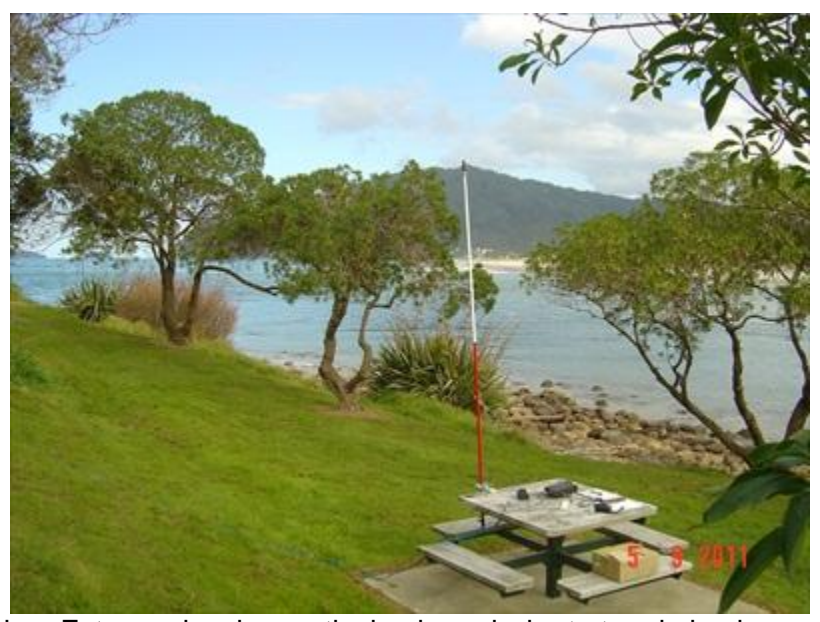
Tairua Estuary showing vertical pole and wire to tree in background.

The first thing that I do is to explore possible sites for operation. Top of hills or close to the sea? In my experience I have found that I get better luck operating close to the sea than I do when up in the mountains. I have no firm scientific basis for saying this other than what has worked for me in the past. I like to work from a sturdy table and seat rather than lug along a table and chair. Luckily in the Coromandel where I live, lovely sturdy picnic tables with benches have been provided at many beautiful spots near the sea. I look for a spot that would have some shade if needed as well as some trees in the vicinity to hook my antenna up on to. I do this as a pre plan so that I don't have to faff around with last minute hitches on the day of operation. I also take into consideration the proximity of power lines as I will be throwing a wire into the air and don't trust my aim. (My aim is great, but it is just that the weighted line does not always go where I want it to go.....)