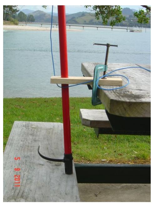
Method of clamping pole to table

Let's start off with the antenna. As I said earlier, I prefer to use a multiband antenna and have a tuner to do the work for me. I have experimented with many different antennas for portable operation including half size G5RV in inverted vee formation, half size Carolina Windom antennas in inverted Vee formation, Buddipole De Luxe in various shapes, ATX Walkabout antennas, Hustler coil and whip antennas, Icom AH703, Miracle Whip etc etc, but the simplest and quickest to put up is what works for me. I don't want to waste a lot of my transmitting time trying to get a dipole into a branch or trying to fine tune a Buddipole with an antenna analyser. Therefore I go with a long wire. What I do is the following;