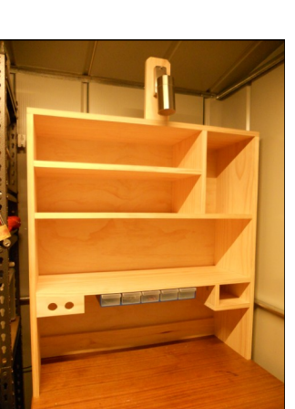
The completed shelf awaiting power connection.

I constructed the shelf from pine timber, which had a width of 300mm. I didn't use any fancy joinery. I simply pre-drilled the ends and used hex-head coach screws to hold it all together. The result was a solid shelf with enough space for electronics and an area for holding A4 sized folders and books.