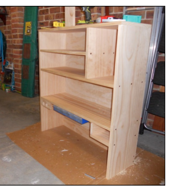
The shelf under construction.

Encouraged by this achievement, I was ready to begin work on some projects that had long been on the drawing board. But there was a problem – not enough light, even during the day with the shed door wide open. The obvious solution was to install some lighting. After a few hours of Google assisted research, I concluded that solar power was the way to go.