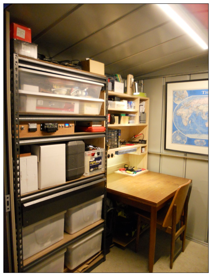
The completed shelf and solar powered shed. This photo was taken at night and shows how effective the lighting was.

If you're facing a similar situation to what I had, I would encourage you to try solar power and make your own custom-built shelving.